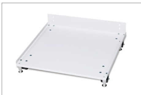
Fig. 04 | Roller base and stand