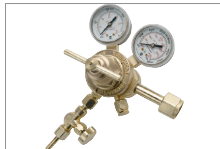
Fig. 03 | Two-stage CO 2 gas regulator