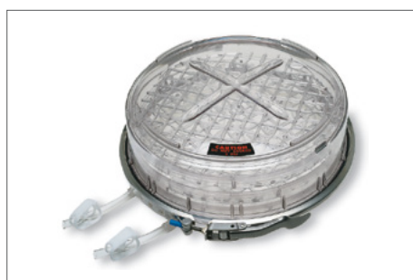
Fig. 05 | Sealed modular incubator chamber