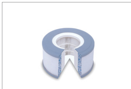
Fig. 02 | HEPA air-filter (VOC)