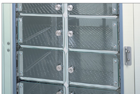
Fig. 01 | Inner glass door kit