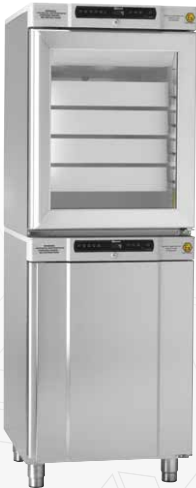
BioCompact II RR210/RF210 Drawers and glass door are optional extras.

The BioCompact II 210/210 is a combination refrigerator and/or freezer cabinet with a small footprint, designed for a wide range of biostorage purposes where the prime focus is on dependability and exceptional performance.