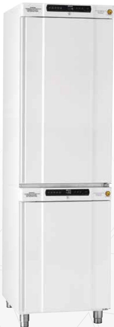
Comes in two boxes and must be assembled before use.

The BioCompact II 310 and 210 provides you with significantly better performance than any other cabinets in this segment, on account of a refrigeration system that does away with cold walls that can damage the contents and a unique air distribution system for storing ordinary biomaterial under consistent, stable conditions.