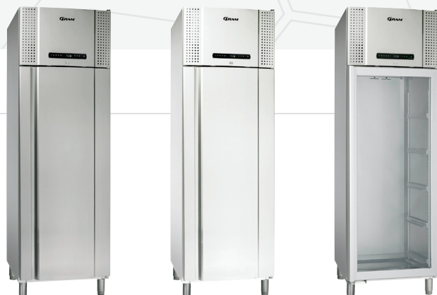
The BioPlus 600/660D is available as a refrigerator or freezer in either white or stainless steel finish. All BioPlus models come with self-closing door. Glass door is available for refrigerator.

In terms of performance, these units are designed to provide the very best results even under exceptional conditions. The BioPlus utilises environmentally responsible HFC-free foam propellants and is available with HFC-free refrigerants.