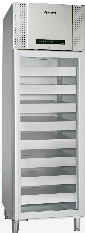
BioPlus 660D. Drawers and glass door are optional extras.

The BioPlus 600/660D range is designed for the storage of the most delicate biomaterials, in situations where even tiny fluctuations in conditions inside the storage cabinet can have a serious effect on the contents.