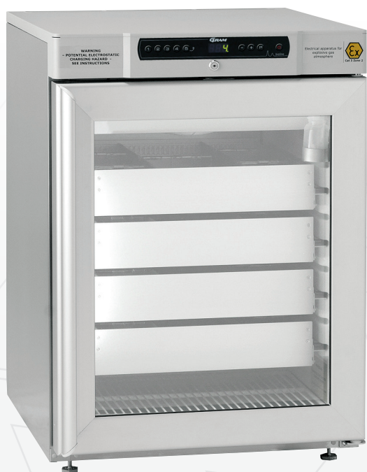
BioCompact II RR210. Drawers, reference container and glass door are optional extras.

The BioCompact II 210 is an under-counter refrigerator or freezer cabinet with a small footprint, designed for a wide range of biostorage purposes where the prime focus is on dependability and exceptional performance.