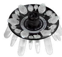
R-2/0.5/0.2 BS-010205-DK rotor

Rotor for 8 x 2/1.5 ml and 8 x 0.5 ml microtest tubes