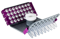
SR-64 BS-010201-EK rotor

Rotor for 2 x 8-section 0,2 ml microtube strips