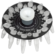
R-0.5/0.2M BS-010201-BK rotor

Rotor for 12 × 0.5 ml and 12 × 0.2 ml microtest tubes