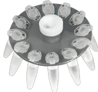
R-1.5M BS-010201-AK rotor

Rotor for 12 × 0.5 ml and 12 × 0.2 ml microtest tubes