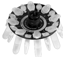
R-2/0.5 BS-010205-CK rotor

Rotor for 8 x 2/1.5 ml and 8 x 0.5 ml microtest tubes