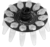
R-1.5 BS-010205-AK rotor

Rotor for 12 x 0.5 ml and 12 x 0.2 ml microtest tubes