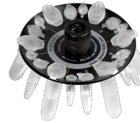
R-2/0.5/0.2 BS-010205-DK rotor

Rotor for 8 x 2/1.5 ml and 8 x 0.5 ml microtest tubes