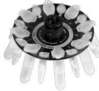
R-2/0.5 BS-010205-CK rotor

Rotor for 8 x 2/1.5 ml and 8 x 0.5 ml microtest tubes