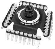
SR-32 BS-010205-FK rotor

Rotor for 2 x 8-section 0,2 ml microtube strips