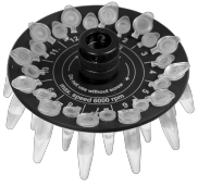
R-0.5/0.2 BS-010205-BK rotor

Rotor for 12 x 0.5 ml and 12 x 0.2 ml microtest tubes