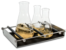
UP-12 BS-010108-AK platform

Universal platform with adjustable bars for different types of flasks, bottles, and beakers with silicone mat.