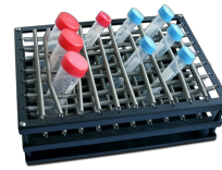
P-16/88 BS-010116-BK platform

Platform with spring holders for up to 88 tubes up to 30 mm diameter (e. g. 10 ml, 15 ml, 50 ml tubes).