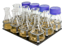
P-12/100 BS-010108-EK platform

Universal platform with adjustable bars for different types of flasks, bottles, and beakers with silicone mat.