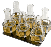
P-6/250 BS-010108-DK platform