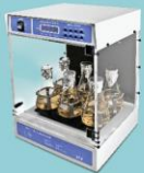
ES-20, Orbital Shaker-Incubator

Applications: • Agglutination • Gel staining/destaining