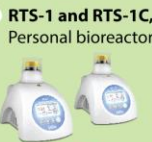
RTS-1 and RTS-1C, Personal bioreactor