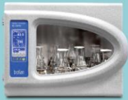
ES-20/80, Orbital Shaker-Incubator

Applications: • Microbiology • Extraction • Cell cultivation