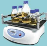
PSU-20i, Orbital Shaker