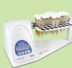
Multi RS-60, Programmable rotator