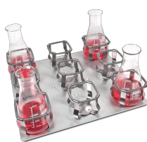
HSP-9/500 BS-010167-NK platform

Platform with tight fit clamps for flasks.