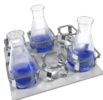
HSP-6/1000 BS-010167-LK platform

Flat platform with non-slip silicone mat can accommodate various low profile containers.