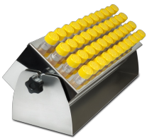
TR-44/15 BS-010135-LK rack

Adjustable angle test tube rack for UP-168