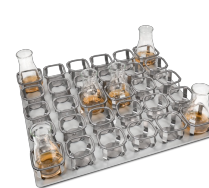
HSP-30/100 BS-010167-KK platform

Platform with tight fit clamps for flasks.