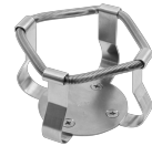
HSC-250 BS-010167-FK clamp

Tight fit clamp 100 ml - Ø65 mm for UP-168