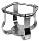
HSC-500 BS-010167-JK clamp

Tight fit clamp 250 ml - Ø85 mm for UP-168