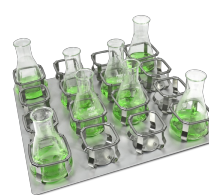
HSP-16/250 BS-010167-MK platform

Platform with tight fit clamps for flasks.