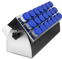
TR-21/50 BS-010135-KK rack

Adjustable angle test tube rack for UP-168