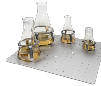
UP-168 BS-010135-JK platform Universal platform with clamps can accommodate flasks or bottles of different volume sizes. Clamps are not included with platform and need to be ordered separately.