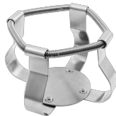
HSC-1000 BS-010167-IK clamp

Tight fit clamp 500 ml - Ø105 mm for UP-168