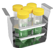
TR-5/30 BS-010406-KK rack

Test tube rack for \varnothing 30mm tubes, capacity 5 tubes. WxDxH: 155x90x112mm