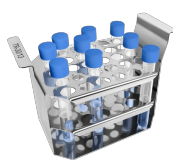
TR-30/13 BS-010406-IK rack

Test tube rack for \varnothing 16 to \varnothing 19mm tubes, capacity 16 tubes. WxDxH: 155x90x112mm