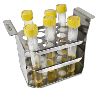
TR-16/19 BS-010406-FK rack

Test tube rack for \varnothing 30mm tubes, capacity 5 tubes. WxDxH: 155x90x112mm