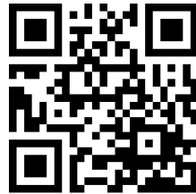
Product class description