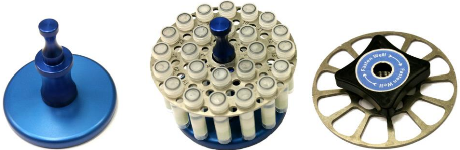
1. Rotor stand