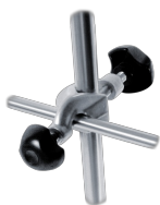
Double clamp for MM-1000 BS-010306-LK

Centrifugal stirrer ( \varnothing 60 mm)