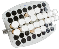
PRS-48 BS-010118-CK platform

14 tubes 20-30 mm diameter (50 ml tubes).