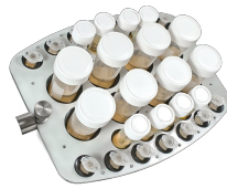
PRS-8/22 BS-010118-AK platform

48 tubes 10-16 mm diameter (1.5 ml-15 ml tubes).