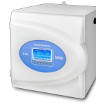
S-Bt Smart Biotherm Software included + RS6, rack with 3 shelves Compact CO 2 Incubator