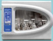
ES-20/80, Orbital Shaker-Incubator

Applications: • Microbiology • Extraction • Cell cultivation