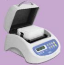
TS-DW, Thermo-Shaker for deep well plates

Applications: • ELISA Analysis • Genomic Analysis • Hybridization • Immunology