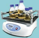
PSU-20i, Orbital Shaker