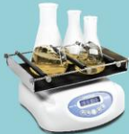
PSU-10i, Orbital Shaker

Applications: • Microbiology • Extraction • Cell cultivation