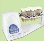
Multi RS-60, Programmable rotator