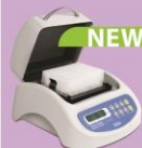
TS-DW, Thermo-Shaker for deep well plates