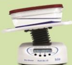
Multi Bio 3D, Mini Shaker

Applications: Agglutination Gel staining/ destaining