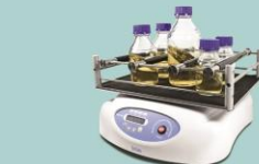
PSU-20i, Orbital Shaker