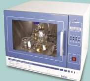
ES-20/60, Orbital Shaker-Incubator

Applications: Microbiology Extraction Cell cultivation