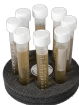
SV-8/15 BS-010210-DK platform