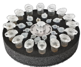
SV-16/8 BS-010210-CK platform

16/8/8 sockets for 1.5/0.5/0.2 ml microtest tubes (Ø 11/8/6 mm).