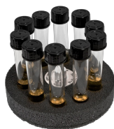
SV-10/10 BS-010210-BK platform

16/8/8 sockets for 1.5/0.5/0.2 ml microtest tubes (Ø 11/8/6 mm).