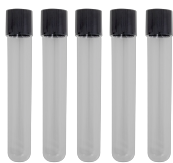
Glass test tubes 16mm BS-050102-MK

Glass Test Tubes 16x100mm, high borosilicate, PP Cap with silicone pad. Packing - 100 pcs/box