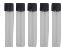
Glass test tubes 18mm BS-050102-NK

McFarland Turbidity Standards, \varnothing 12 mm