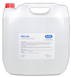
PDS-10L BS-040107-FK DNA/RNA Decontamination Solution 10l