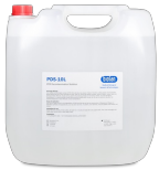
PDS-10L BS-040107-FK DNA/RNA Decontamination Solution 10l