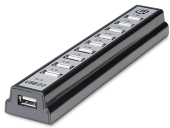
USB 2.0 Hub 10 × ports BS-010158-BK